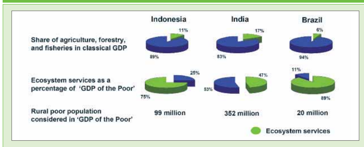
Figure 2: 'GDP of the poor': estimates for ecosystem service dependence