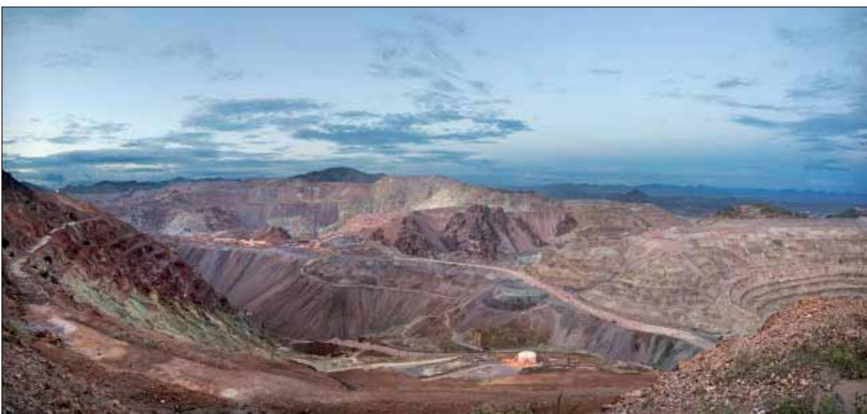
Morenci Mine, largest copper mine in the United States: mining and quarrying may have considerable impact on landscapes.